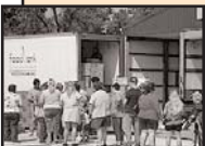
Each Food Fair helps on average 200 families in need.

The St. Louis Area Foodbank provides hunger relief to 26 counties throughout Eastern Missouri and Southwestern Illinois. One of our most significant challenges has always been reaching the rural communities located within those 26 counties. In 2007, we began a "Food Fair" program specifically developed to target underserved areas.