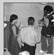
Taste of the NFL Event Team Captain, Steven Jackson signs autographs for guests.

More than 500 guests attended and helped raise $75,000 for the St. Louis Area Foodbank and the St. Louis Sports Commission. Presented by Edward Jones, Taste of the NFL is a food and wine-tasting extravaganza in which attendees are able to sample specialty foods prepared by local chefs, bid on unique items, and meet the chefs and Rams' players.