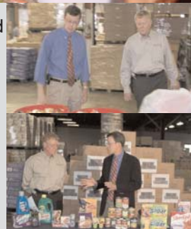
Above, Senator Jim Talent visits our distribution center and speaks with the media about the importance of a community-wide food drive the Foodbank coordinated in response to Hurricane Katrina.

The help we provided to the Gulf Coast is important. But, it's also important to help here at home too. In the wake of the recent storms and