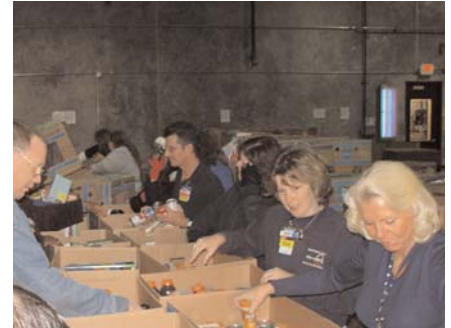
Wal-Mart Associates volunteering at the St. Louis Area Foodbank

VISIT STLFOODBANK.ORG/VIDEO TO WATCH LOCAL NEWS COVERAGE OF THE ANNOUNCEMENT.